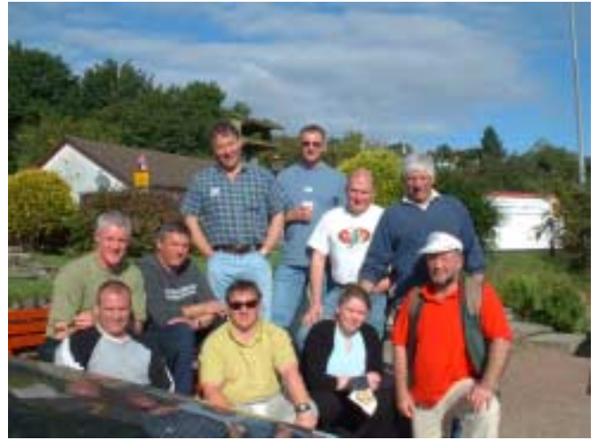
The happy buddies who survived the weekend.

"When is the next one and who is organising?"