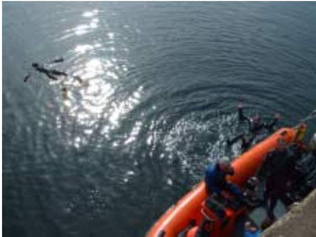
Just "chillin out" at tobermory.

After another entertaining evenings refreshment and amusement, the Saturday found us waiting for slack water at the Hispania with Padi boats from Oban. The wreck sit upright with a "slight" tilt to starboard (seems like 45° when on the deck!) It has a truly spectacular crop of sealife adorning the upper sunlit areas and great big holds and passageways to explore.