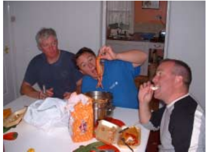
Scoffing some king prawns from Tobermory