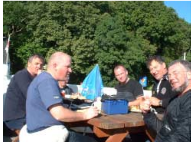
More refreshments at Tobermory in the sun.