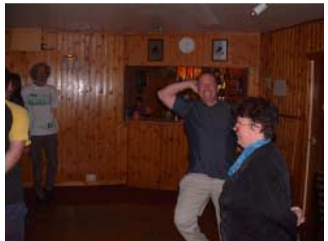
Gordon gets into the swing after a few drinks.