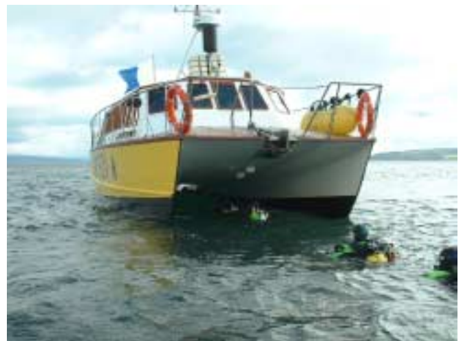
The Urchin from the Puffin Dive Centre at Oban collects some Padi divers who swim up between the keels and climb a ladder in the middle to reboard.